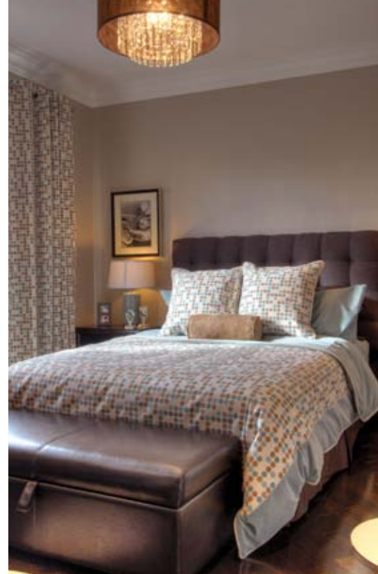
RIGHT: One of four lovely bedrooms on the upper level.

CountryWide Homes offers the latest contemporary floor plans ranging from 3,100 sq. ft. to over 6,700 sq. ft. and are priced as low as $769,990. "Only the latest designs and finishes are incorporated into these homes," she says. "And they conform with EnergyStar standards."