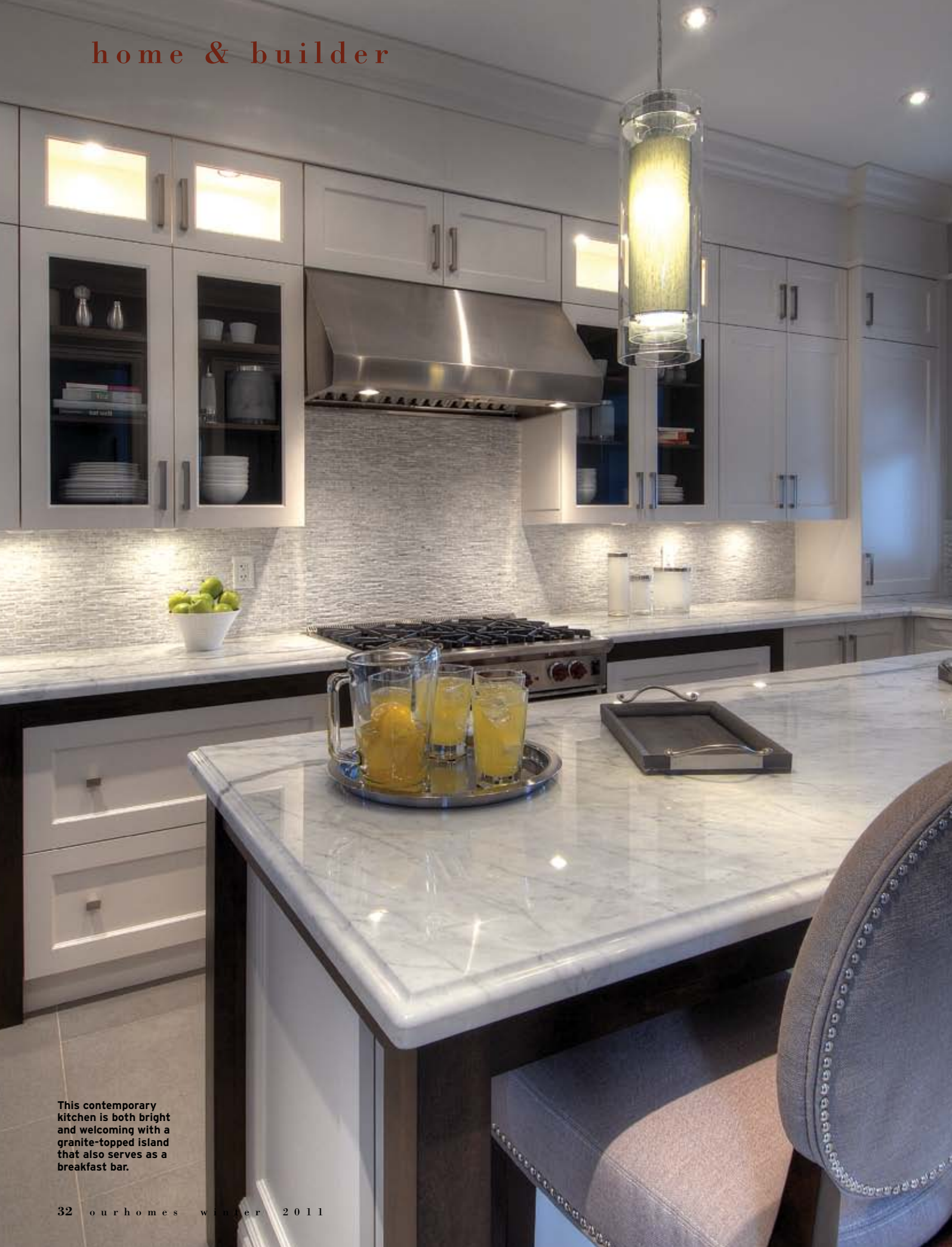
This contemporary kitchen is both bright and welcoming with a granite-topped island that also serves as a breakfast bar.