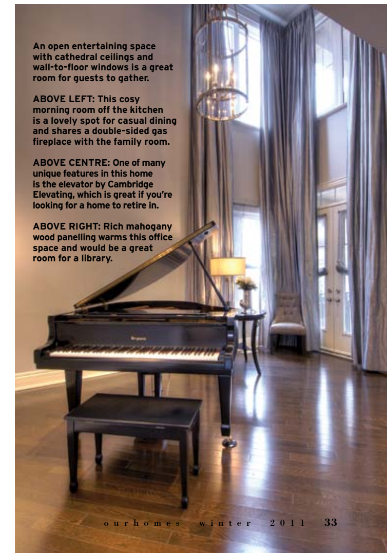
ABOVE RIGHT: Rich mahogany wood panelling warms this office space and would be a great room for a library.