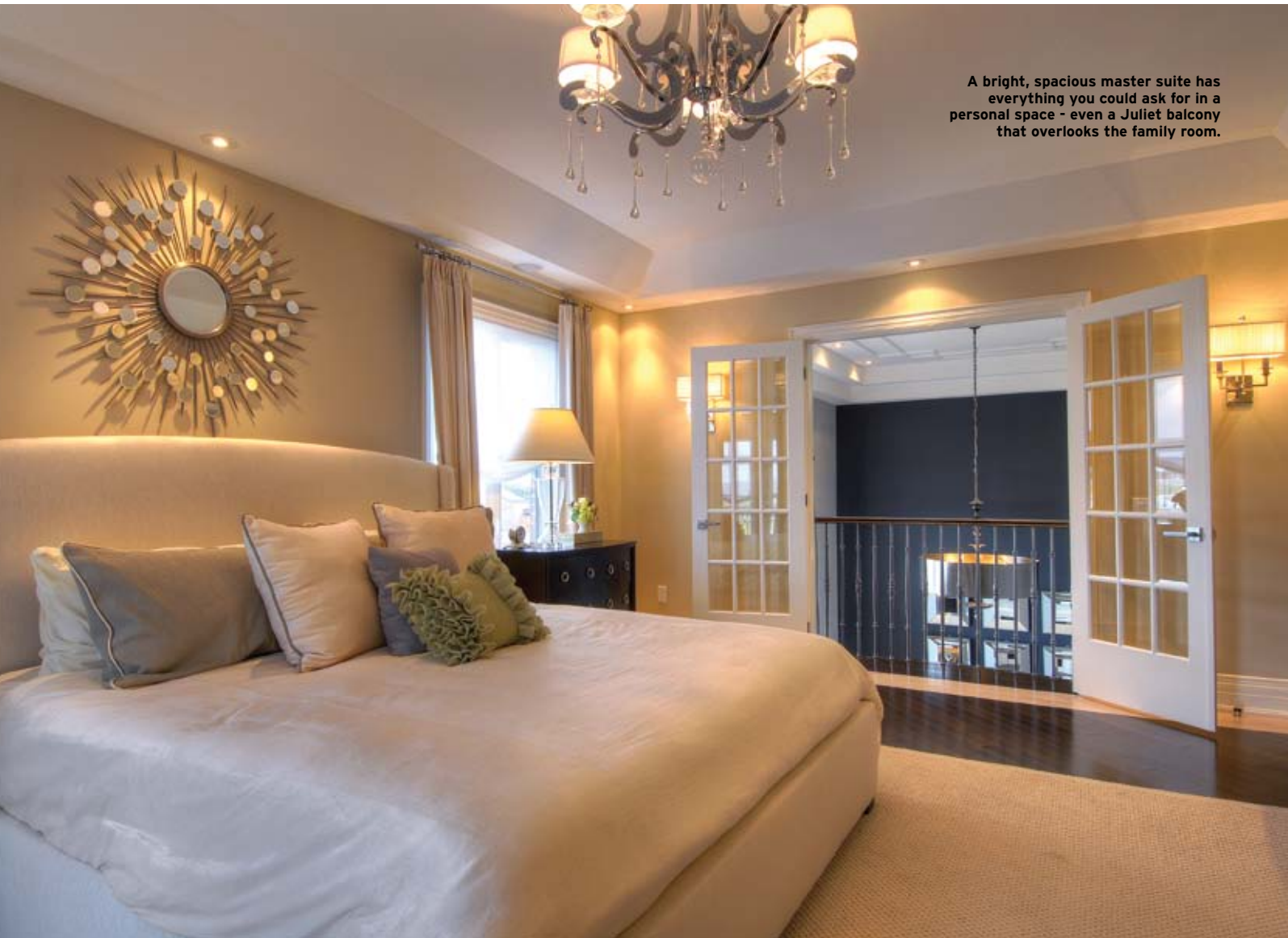
A bright, spacious master suite has everything you could ask for in a personal space - even a Juliet balcony that overlooks the family room.

Following the gathering room is a trendy and spacious kitchen. A granite island from Advanced Marble & Granite (AMG) acts as the focal point in the room. Crisp white cabinets from Villa Kitchen Centres extend up to the ceiling and meet with matching crown mouldings. A wet bar is attached to the kitchen and leads to a formal dining area while a cosy breakfast room at the back of the home can be used as a casual dining space.