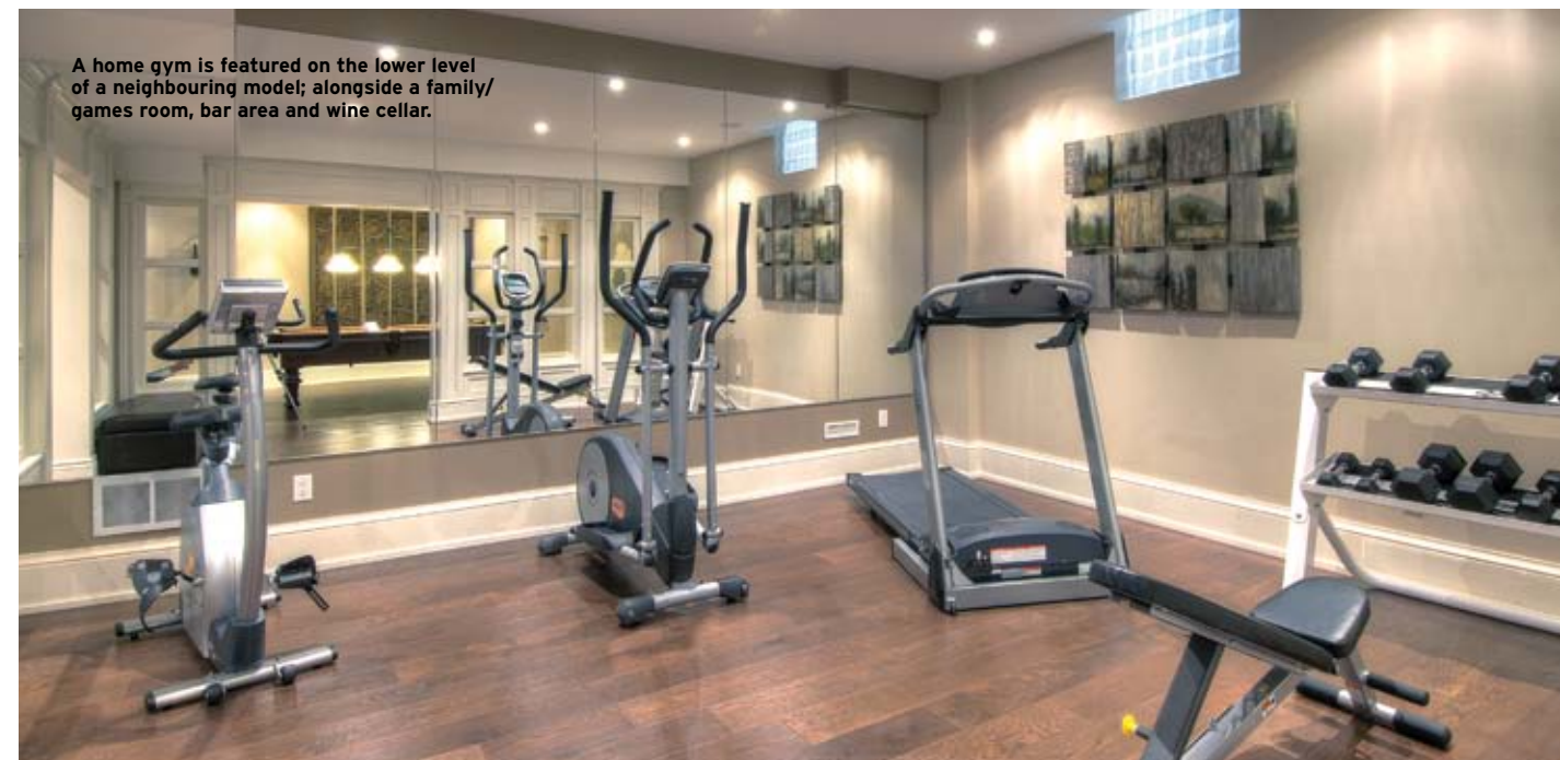
A home gym is featured on the lower level of a neighbouring model; alongside a family/games room, bar area and wine cellar.

A large range of lot sizes are available at King Country Estates with several bordered by the Humber River and the Oak Ridges Moraine. A quick 20-minute commute to Toronto allows residents to enjoy all the luxuries of an urban lifestyle while living in a haven surrounded by nature. OH