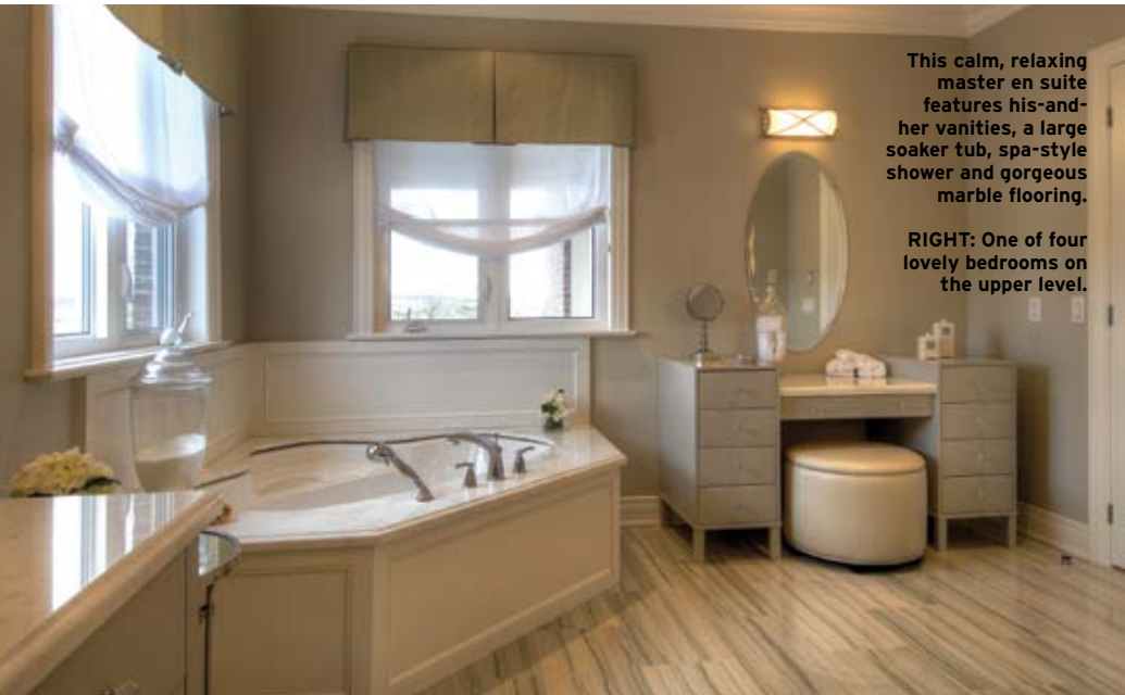
This calm, relaxing master en suite features his-and-her vanities, a large soaker tub, spa-style shower and gorgeous marble flooring.