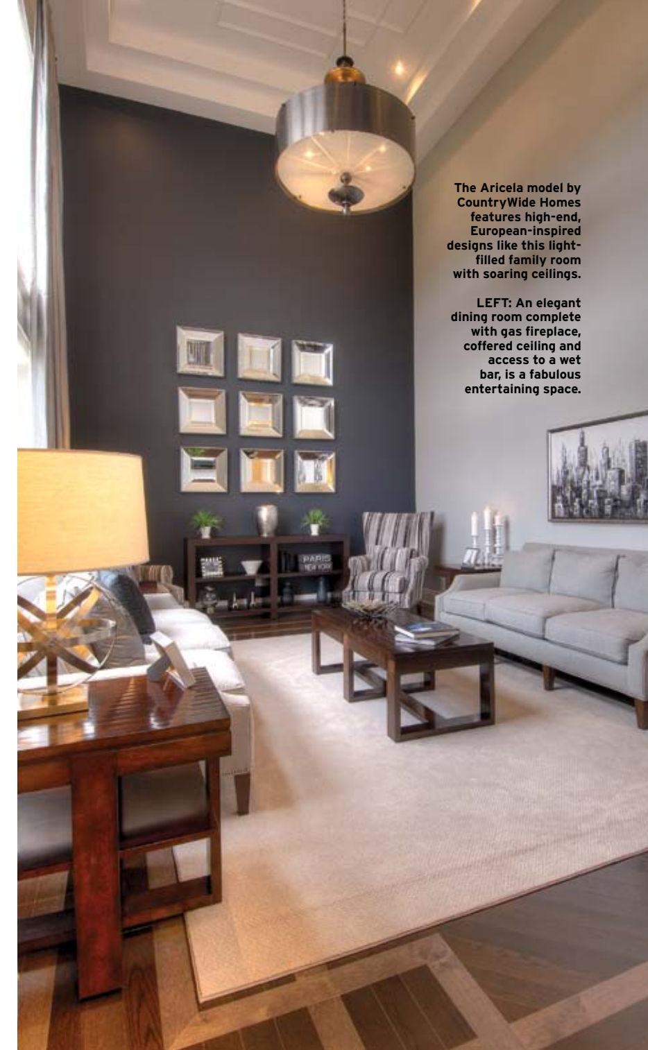
The Aricela model by CountryWide Homes features high-end, European-inspired designs like this light-filled family room with soaring ceilings.